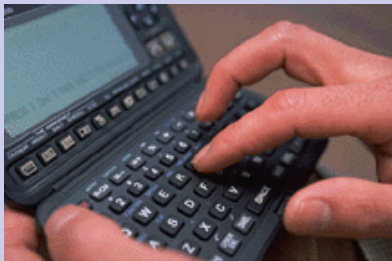
Local Engineers Fulfilling Local Needs